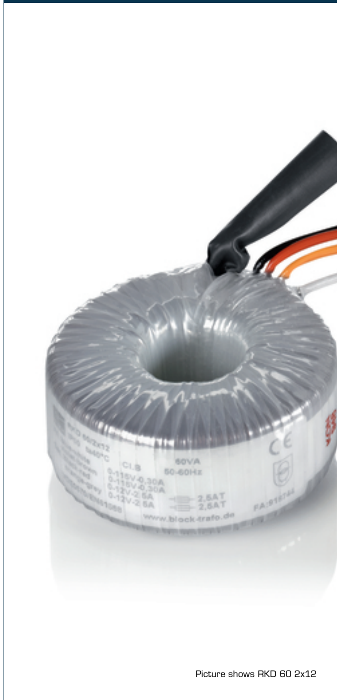
Picture shows RKD 60 2x12